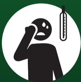
Fever and Tiredness